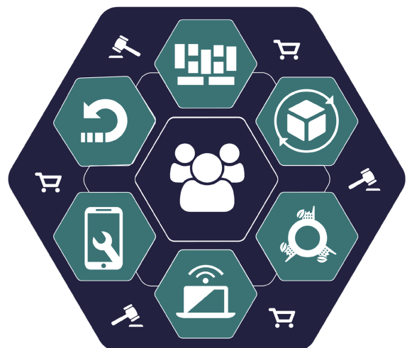
The CE-readiness app is a new tool for companies to ease their transition to circular economy.

make a difference for a company because they are relevant and based on real life experiences. So we hope and believe that the same results can be obtained with MATChE and Danish companies’ engagement in circular economy.”