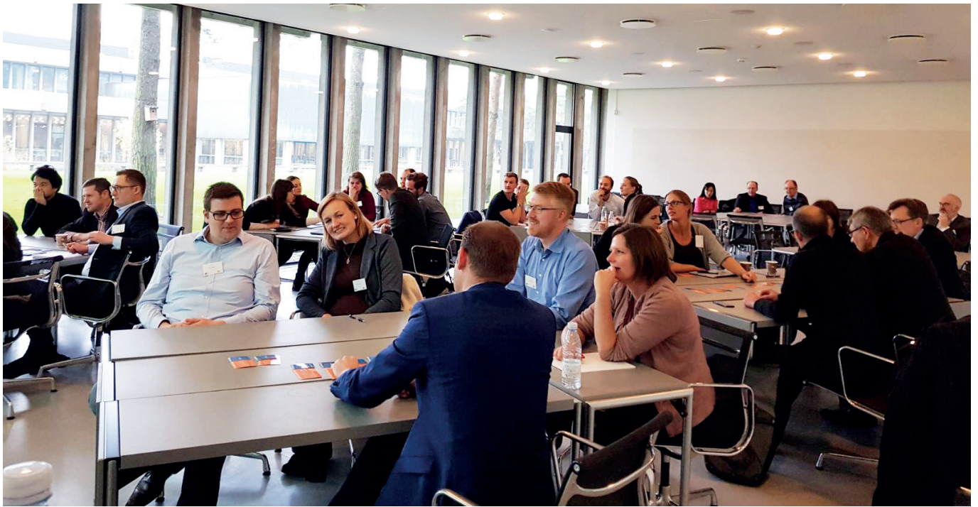
One of the CIRCit project's many company engaging workshops helping to create circular economy priorities.